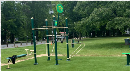
Rockwell AME Zion Church's outdoor fitness area

Three community gardens were created to expand access to fresh fruits and vegetables in priority communities. Grant funding also provided transportation access for 65 seniors to the Uptown Farmer's Market. Food distribution/pantry programs provided food access to over 13,643 County residents .