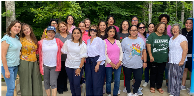
Faith and Health Latino Coalition Leadership Training

In FY23, Mecklenburg County officially welcomed the Faith and Health Latino Coalition (FHLC) as a vendor. Staff worked with the FHLC Board of Directors throughout the year to help them understand the process for applying for grant funding and overseeing grant-related activities and supported FHLC in updating their marketing materials, social media accounts, and building a new website ( https://feysaludnc.org ).