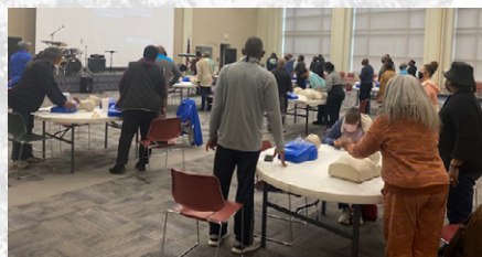
Friendship Missionary Baptist Church CPR/First Aid Certification

For more information about grant opportunities, visit https://health.mecknc.gov/population-health/office-health-equity/health-equity-grants-program .