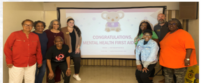
Adult Mental Health First Aid Training

VHB participants were referred to two evidence-based programs: 11 VHB participants completed the 12-week YMCA EMPOWER program, and 8 VHB participants completed the 6-week Living Healthy program, offered in collaboration with Atrium Health and Centralina Area Agency on Aging.