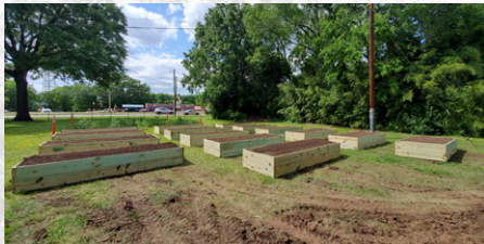
Iglesia Cristana Puerto Nuevo/ Steel Creek YMCA Community Garden

In the program's third year, 33 grantees were awarded a total of $447,933 in funding to address health disparities and chronic disease prevention and education and to support PSE.