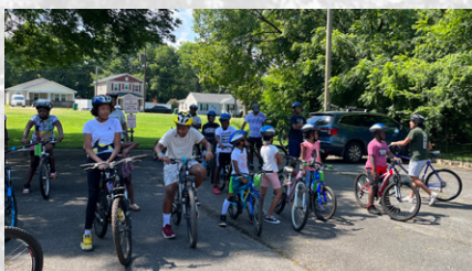
Trips for Kids Saturday Bike Riding Event.

Eight grantees organized in-person and virtual healthy cooking demonstrations for 816 participants . Other grantees facilitated physical activity classes which included yoga, line dancing, cross-fit, boxing classes, aerobics, walking clubs, and mental health first-aid classes.