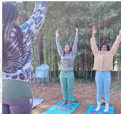
AAA Therapeutic Yoga Class

Eight grantees organized in-person and virtual healthy cooking demonstrations for 816 participants . Other grantees facilitated physical activity classes which included yoga, line dancing, cross-fit, boxing classes, aerobics, walking clubs, and mental health first-aid classes.